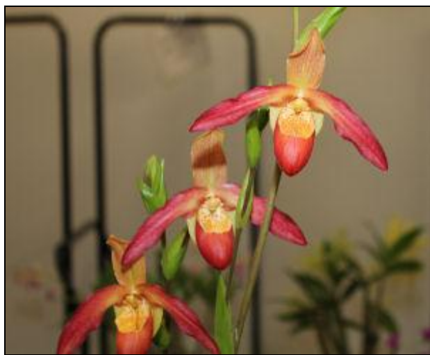
Phrag Noirmont - Joe Crawford