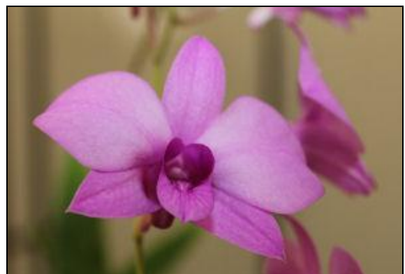
Dend biggibum – Malcolm Pearce