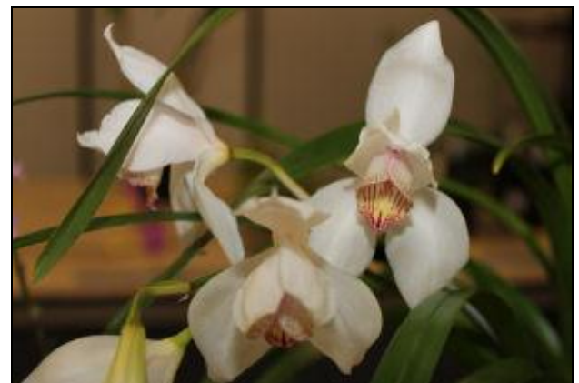
Cym erythrostylum - Anita Evans