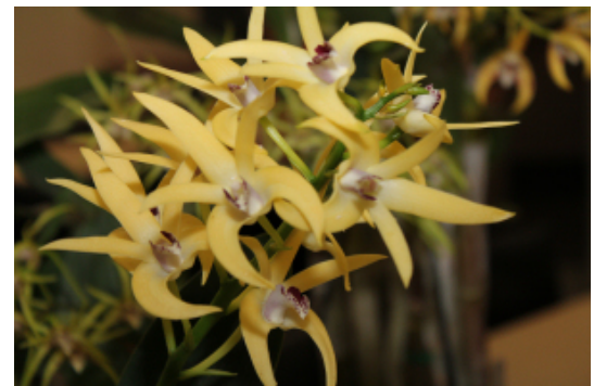
Dendrobium Avril's Gold 'Pumpkin Pie' - Le Tan Liep