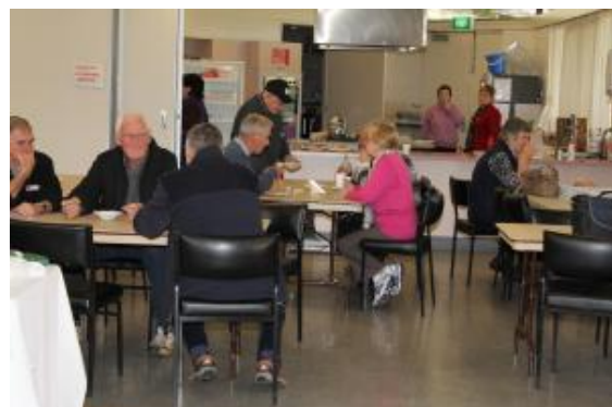
Top three photos courtesy Peter Caly