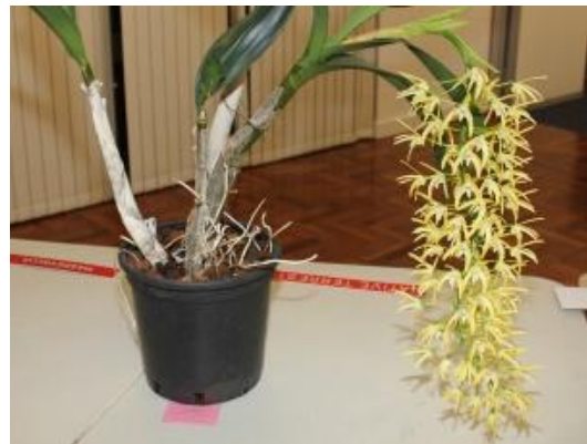
Dend speciosum 'Larcon Dream'

Dend speciosum 'Larcon Dream' Thi Tuyet – Loan Do