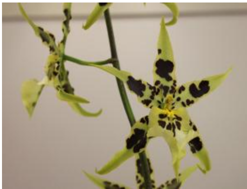
Maclellanara Pagan Love Song