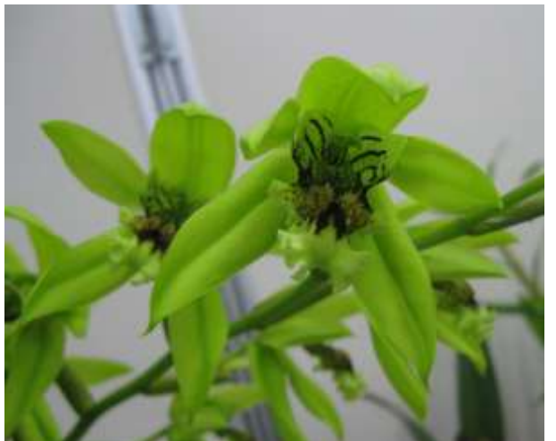
Above: Coelogyne mayeriana