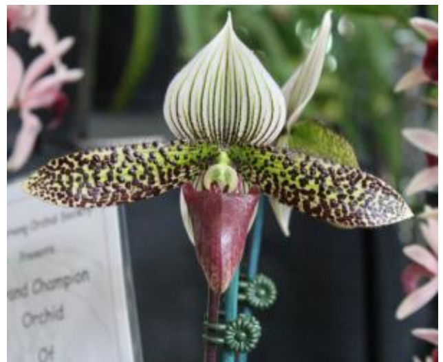
Grand Champion Orchid of the Show & Champion Paphiopedilum

Paph Raisin Eyes x sukhakulii J W Crawford