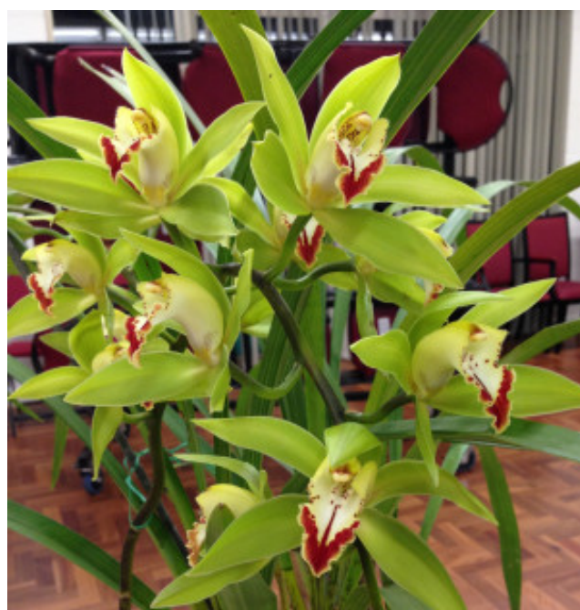
Best Species Cymbidium Cym lowianum var Grandiflorum Tony Lopreiato