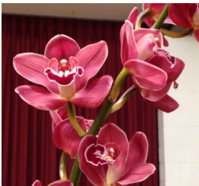
Best Intermediate Cymbidium Cym Claude Pepper x Red Beauty Dau Nguyen