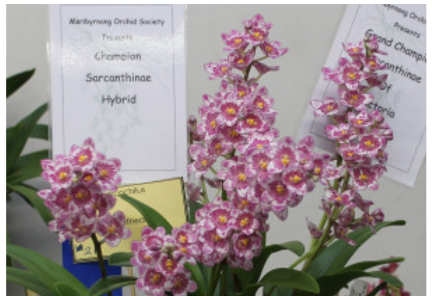
Grand Champion Sarcanthinae of Victoria, Champion Sarcanthinae Hybrid, Best complex Sarcocochilus Hybrid (non intergeneric). Awarded HCC/AOC 2016 (Vic) Sarcocochilus Sweetheart - Lorraine Fagg