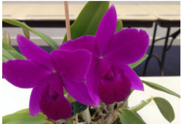
Best in Open and Judges Vote, Lc Mini Purple 'Tamami' by Joe Crawford