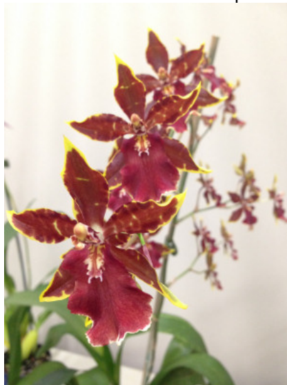
Colmanara Wildcat 'Bobcat'