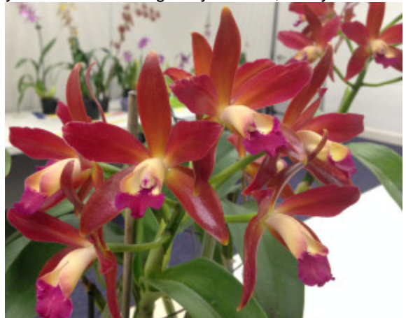
Best in Advanced Novice, Cattleya Chocolate Drop x C guttata , A-Sat Chenh