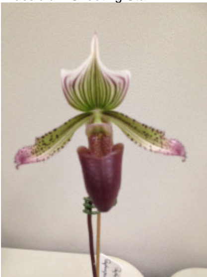
Paph holdenii x superbians