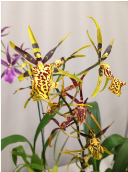
Brassidium Shooting Star